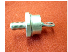
1N4510 Standard Rectifier (trr More Than 500ns)