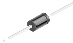
DO-35 Glass case COLOR BAND DENOTES CATHODE